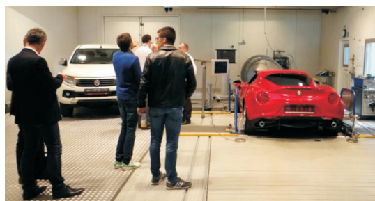
Participants during the coffee break, viewing the climatic chamber (with 4WD chassis dynamometer) at BOSMAL

the full WLTP [procedure] improves the situation somewhat (mainly due to the redefined test inertia), but the road-laboratory gap has not yet been closed when it comes to \text{CO}_2/\text{FC} . A number of questions asked in the summary of the opening presentation were touched upon and answered by presenters in further presentations. These theses for further discussion were: