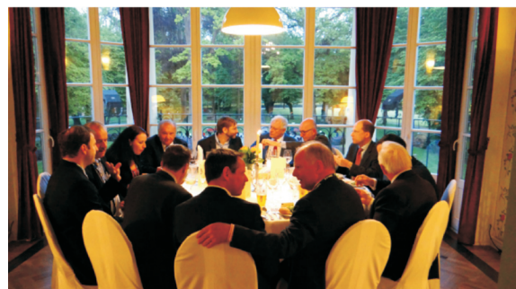
Dinner and musical soiree at Kotuliński palace at the end of the first day of the symposium