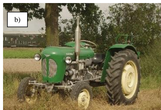
Fig. 5. Unique monuments of engineering art in the collections of the National Museum of Agriculture and Food Industry in Szreniawa: a) Motor Polski produced in Żnin in 1930, b) Ursus C-342 produced in Warsaw in 1965

Currently, it is very important to build awareness among people, especially those related to technical activities in the field of saving monuments of engineering art. Referring to