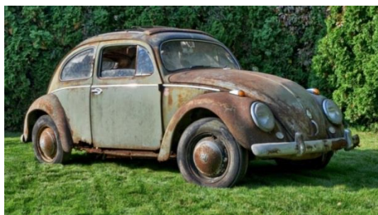
Fig. 3. Object undergoing renovation: Volkswagen Type 117 car produced in Wolfsburg in 1954

In parallel to the engine renovation, renovation works on the gearbox were carried out. The vehicle's transmission was equipped with synchronizers and helical gears for 2 nd , 3 rd , and 4 th gear for easier operation and lower noise emission. During conservation work, it was found that the synchronizers had visible damage on the surface, which may indicate that the material was too plastic or that the impact load was too high. The element that could not be replaced due to lack of availability was the shaft transmitting torque from the engine to the transmission. Pitting occurred around the sealant, so it was decided to apply several layers of technical chrome to the damaged surface and then reduce the diameter to the nominal diameter in the process of abrasive machining. The last stage was the final assembly with the addition of lubricating liquid (Fig. 4).