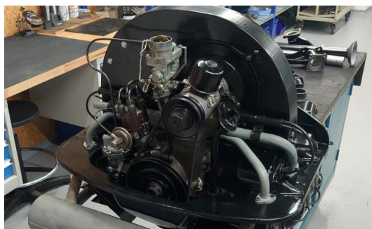
Fig. 4. The engine of a Volkswagen Type 117 car at the assembly station

In parallel to the engine renovation, renovation works on the gearbox were carried out. The vehicle's transmission was equipped with synchronizers and helical gears for 2 nd , 3 rd , and 4 th gear for easier operation and lower noise emission. During conservation work, it was found that the synchronizers had visible damage on the surface, which may indicate that the material was too plastic or that the impact load was too high. The element that could not be replaced due to lack of availability was the shaft transmitting torque from the engine to the transmission. Pitting occurred around the sealant, so it was decided to apply several layers of technical chrome to the damaged surface and then reduce the diameter to the nominal diameter in the process of abrasive machining. The last stage was the final assembly with the addition of lubricating liquid (Fig. 4).