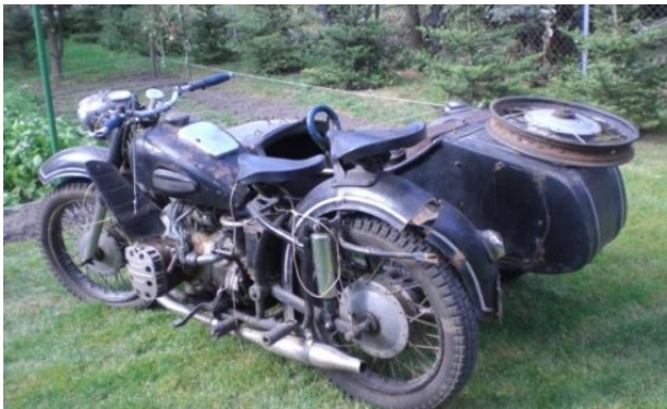
Fig. 1. Object undergoing renovation: K-750 motorcycle produced in Kiev in 1962

changes in the node. Scratches on the pistons indicated that the filter in the power supply system and the mechanical oil filter should be checked frequently.